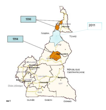
Fig. 1: Map of Cameroon showing the location of the three major YF outbreaks reported during the last two decades (1990, 1994 & 2011)

Following this investigation, a reactive mass vaccination campaign targeting 1.2 million people was conducted in 8 health districts considered at high risk, namely Guider, Bibemi, Gaschiga, Lagdo, Mayo-Oulo, Garoua I, Garoua II, and Golombe.